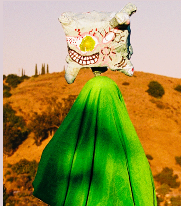
FREAK NATURE, PUPPETEERS

Freak Nature is a collective of artists and puppeteers. They are the 2024 artists-in-residence at the Elysian Theater in Los Angeles. Past collaborators include the Bob Baker Marionette Theater, avant-puppeteers Poncili Creacion, and musician Childish Gambino. Past performance venues include The Skirball Center, Zebulon, Golden Gate Park, and Stomping Ground LA.