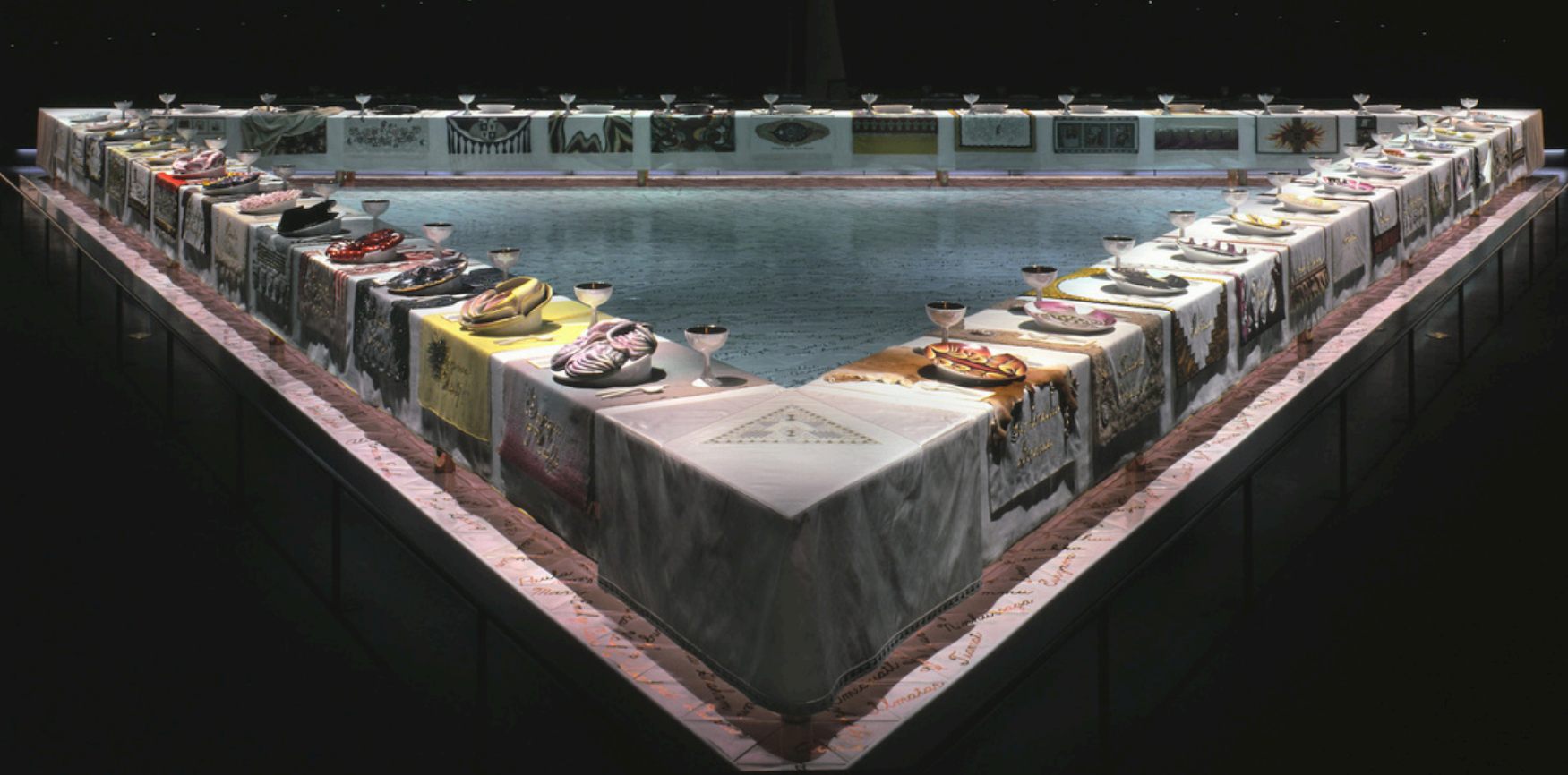
Judy Chicago's The Dinner Party

The Father leads us as performers and audience alike take their turns reading from the script. But other family members—Mother, Daughter, Son, & Baby—played by actors, dancers, and puppets, continually interrupt, bursting onto the 'stage' to challenge the Father's grip on order and on the meaning of this spring rite.